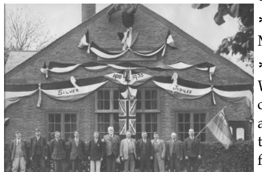
Byfleet Comrades Club decorated for George V's Silver Jubilee